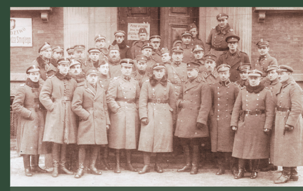
Polish and Latvian officers at the Polish command post in Daugavpils, February 1920

21 January The last Bolshevik bastion in Latgale, Rēzekne, falls