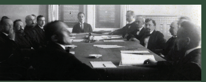
Signing of the Latvian-Soviet Peace Treaty, Rīga, 11 August 1920

11 August Latvia and Soviet Russia sign Peace Treaty