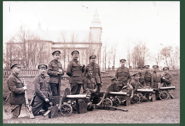
Latvian Army machine gun unit at a church in Ludza, spring 1920

1 February Latvia finally cleared of all enemy forces