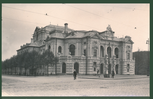
The Latvian National Theatre where the independent Republic of Latvia was proclaimed on 18 November 1918

Late November Latvia invaded by the Soviet Red Army